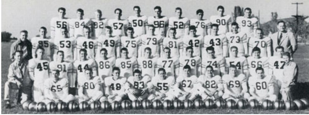
1951 Golden Norse Football Team

1951 Golden Norse Football Team: In 1951, the Golden Norse Football Team completed its first undefeated season in the history of the college and won the Oklahoma Junior College Conference Championship. The Norseman of 1951 also became the only unbeaten college squad in the state of Oklahoma. They managed a post-season game bid from the Texas Junior College Rose Bowl.